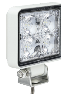
Inactive - 7312WM