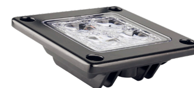
Inactive - 73120BM