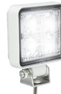
Active - 7312WM