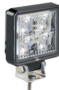
Inactive - 7312BM